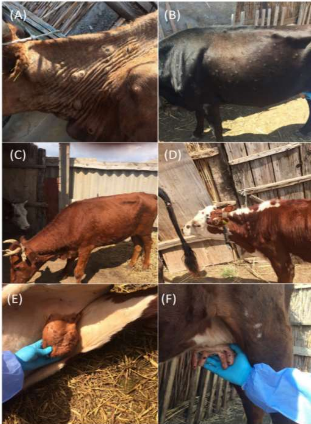
Figure 2. Cattle exhibiting LSD characteristic clinical signs in the outbreak foci in Republic of Kazakhstan in 2016. The body surface of infected animals exhibited extensive circumscribed and convex skin nodules (a-d) with ulceration of the scrotum and the teats (e-f)