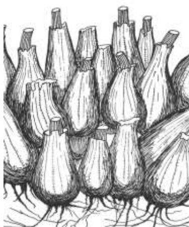
Figure 3. The formed nest of Allium altaicum on the Lineysky ridge in mountain-forest conditions, 1361 m a.s.l.