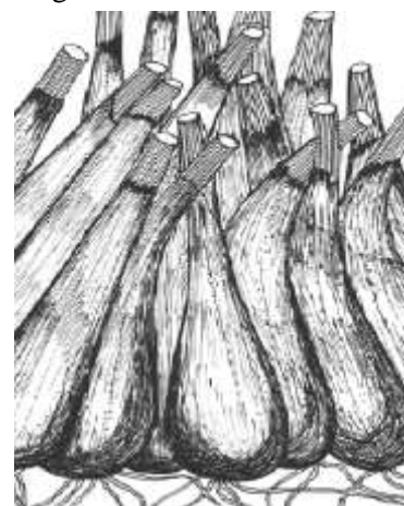
Figure 4. Formed nest of Allium altaicum on the Kalba ridge in mountain-steppe conditions, 832 m a.s.l.