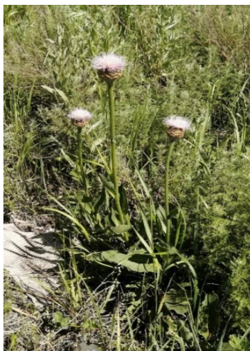
Figure 2. Flowering plant of Rhaponticum serratuloides

6. Rhaponticum nitidum Fisch. (= Centaurea nitiida (Fisch.) B. Fedtsch., Leuzea nitida (Fisch.) Holub, Rhaponticum caspium Kar., Stemmacantha nitida (Fisch. ex DC.) Dittrich), shay-zhaprak (in Kazakh). It takes second place on dissemination and distribution after Rh. serratuloides in Kazakhstan. It is found in 10 floristic regions: Betpakdala, Aral, Western Uplands, Aktobe, Emba, Kzyl-Orda, Zaisan, Kyzylkum, Balhash-Alakul, and Western Tien Shan region. It grows in clayey and sandy steppes, along the slopes of remnants, along rocky banks and dry riverbeds on the plains. It is a mesoxerophyte [13] and early growing fodder plant [15].